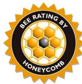
Verification Manager Honeycomb BEE Ratings